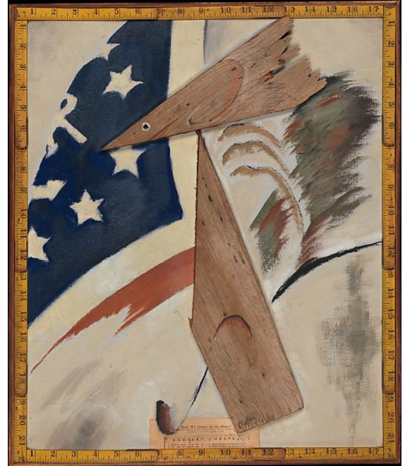
Figure1. Arthur Dove, Portrait of Ralph Dusenberry , 1924, Oil, folding wooden rulers, wood, and cut-and-pasted printed paper on canvas, 22 x 18 in. (55.9 x 45.7 cm). The Metropolitan Museum of Art, New York.

Review Short Paper #2: Structure handout.