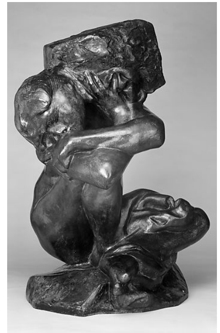
Figure 2. Auguste Rodin, Fallen Caryatid Carrying Her Stone , modeled 1881, cast 1981. Bronze, 51 1/8 x 37 1/2 x 37 1/2 in., 613 lb. (129.9 x 95.3 x 95.3 cm, 278.1 kg). The Metropolitan Museum of Art, New York.